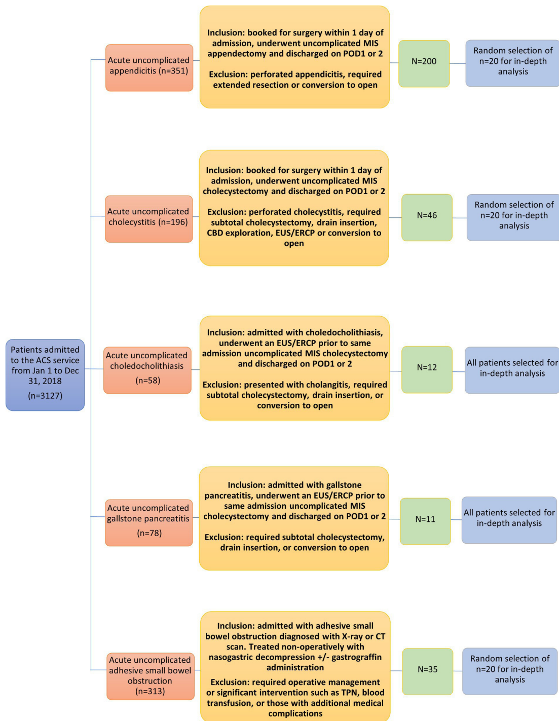
Figure 1 Inclusion and exclusion criteria for the five common acute surgical conditions studied, and corresponding patient populations. ACS, acute care surgery; CBD, common bile duct; ERCP, endoscopic retrograde cholangiopancreatography; EUS, endoscopic ultrasound; MIS, minimally invasive surgery, POD, postoperative day; TPN, total parenteral nutrition.

criteria for uncomplicated presentations and treatment courses (table 1). A random sample of up to 20 patients was selected from each diagnostic group and reviewed in depth, comprising the ‘sample study population’ (N=83). For choledocholithiasis and gallstone pancreatitis, all patients who met criteria (N=12 and N=11, respectively) were reviewed. The most common admission diagnosis was appendicitis (66%), followed by cholecystitis (23%) and adhesive small bowel obstruction (12%).