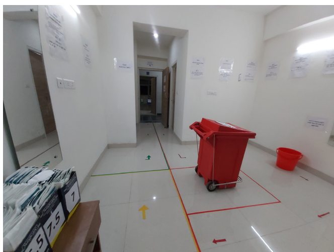
Figure 3 Design of the doffing room.

There was considerable awareness and interest in COVID-19 among staff due to social media coverage.