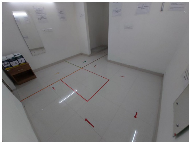
Figure 2 Layout of the floor in the doffing room.

We used the 5S tool to set up and sustain the donning and doffing areas (table 3). We created a checklist for the donning and doffing areas (table 4).