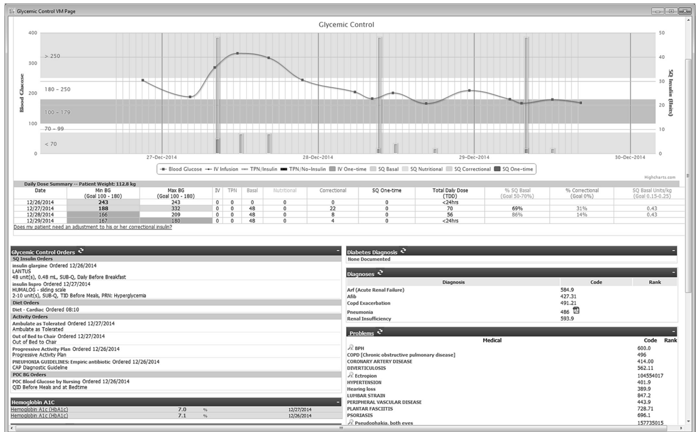
Figure 2 Glycaemic control clinical chart. Comprehensive visual summary of patient glycaemic control clinical data within the Electronic Health Record with links to evidence-based insulin order sets. Visible patient data included: diagnosis, haemoglobin A1c (HbA1c) level, diet orders, insulin orders, point of care testing orders and a graphical representation of units and time of insulin administrations and blood glucose values.

period itself and the postintervention sustainability period (1 September 2013 to 31 December 2014). The data were assessed graphically using statistical process control charts, and analysed with segmented time series regression with Prais-Winsten correction for autocorrelation.