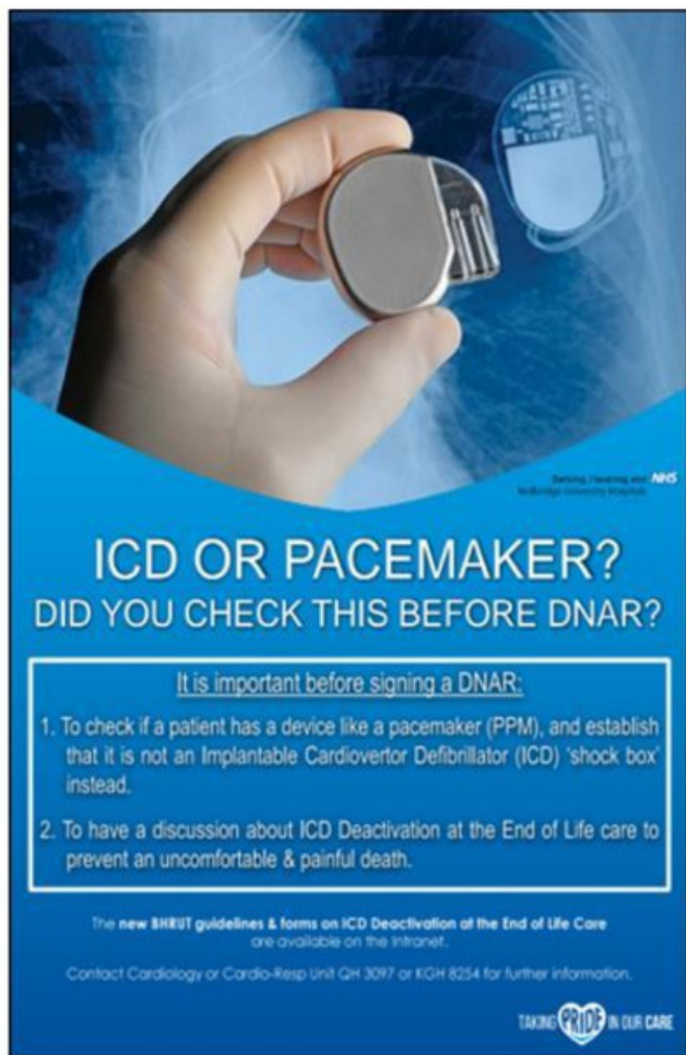
Figure 2 The poster displayed across the wards and on our Trust intranet. DNAR, do not attempt resuscitation.

We co-authored (in collaboration with palliative care colleagues) a special paragraph in the updated Trust guidance pathway on end-of-life care to remind clinicians about ICD management at the time of planning DNAR decisions. Our Trust guidance on ICD deactivation in patients approaching end of life was formally introduced in January 2016, so we decided to monitor starting in February 2016.