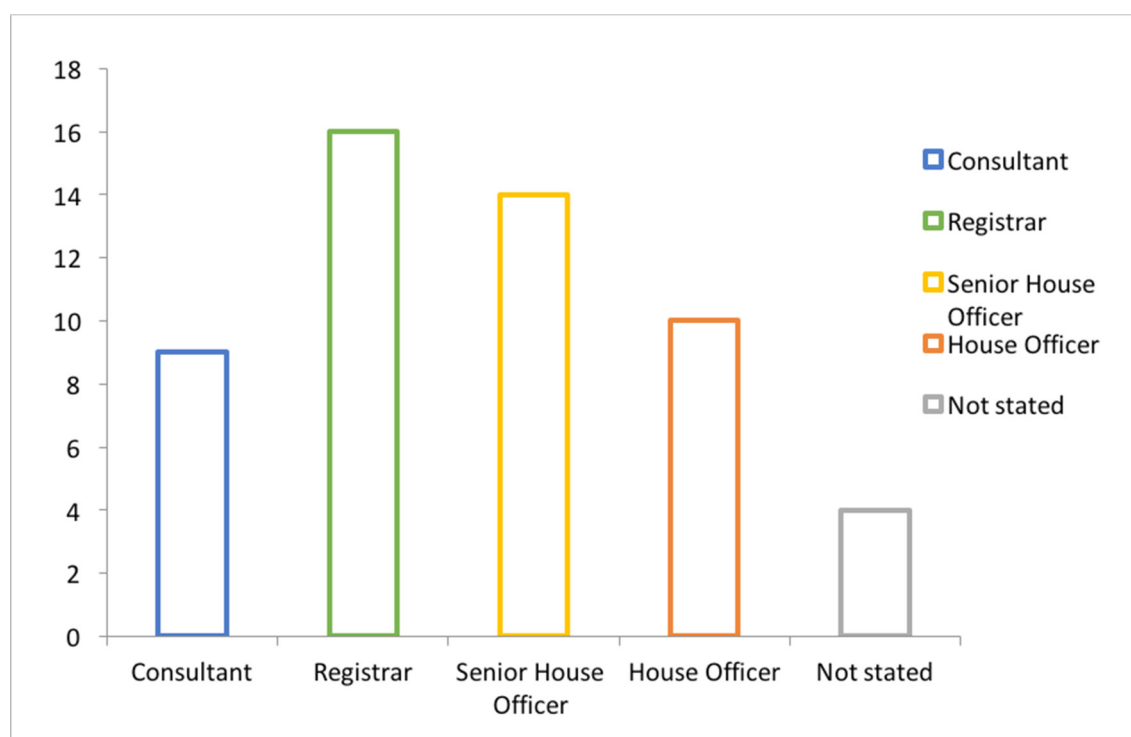
Figure 2 Number of Fit Notes completed via EPR at Denmark Hill by grade of requester.

In our initial staff survey, 22 staff responded: 12 consultants, 7 specialty registrars, 1 specialty trainee 1-2 or